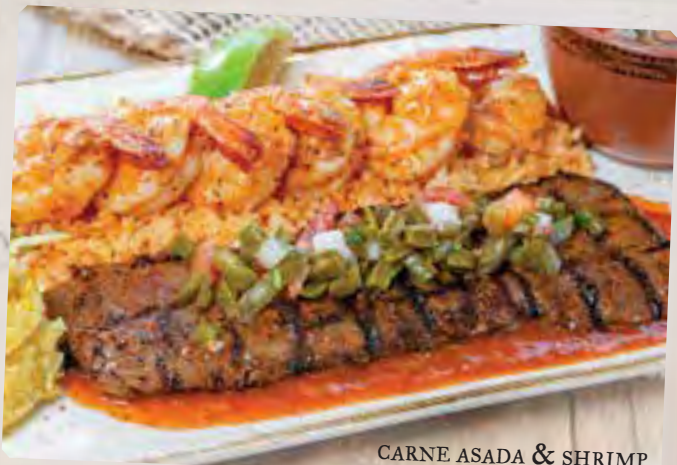
CARNE ASADA & SHRIMP

Fresh Pasilla Chile filled with vegetables and cheese then grilled and placed on a bed of rice and tomato-basil sauce. Topped with green onions, red bell peppers and cotija cheese. 13.00 Chicken add 1.00 • Steak* or Shrimp add 2.00