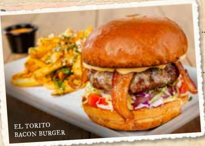
EL TORITO BACON BURGER

Our house-made tortilla soup served with our signature Mexican caesar salad. 8.50