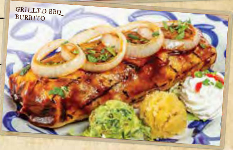
GRILLED BBQ BURRITO