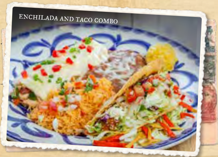
ENCHILADA AND TACO COMBO

This traditional dish mixes chicken, cheese, red and green bell peppers, onions and tomato-jalapeño sauce on a bed of rice. Topped with sour cream and served with choice of tortillas. 16.00