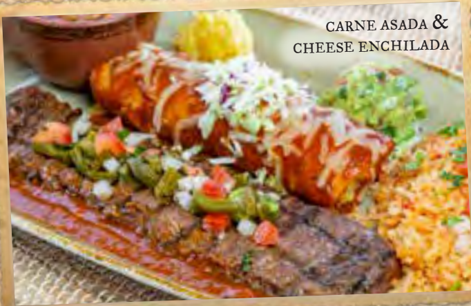
CARNE ASADA & CHEESE ENCHILADA