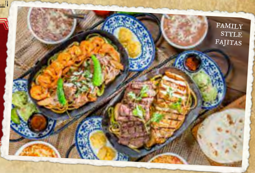
FAMILY STYLE FAJITAS

Steak*, Large Shrimp, Chicken and Carnitas Fajitas served with rice, refried beans, guacamole, sweet corn cake and choice of tortillas. 65.00 Sides are endless, just ask for more!