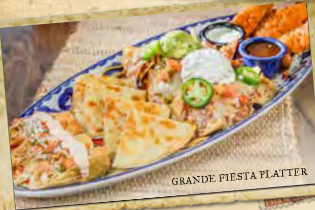
GRANDE FIESTA PLATTER