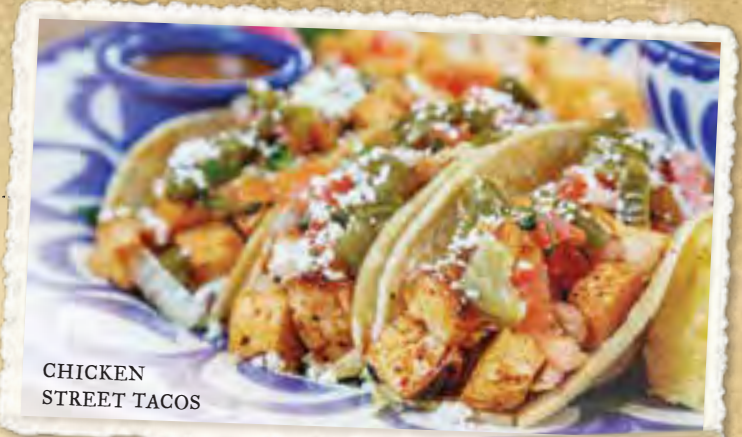
CHICKEN STREET TACOS