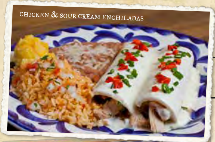
CHICKEN & SOUR CREAM ENCHILADAS