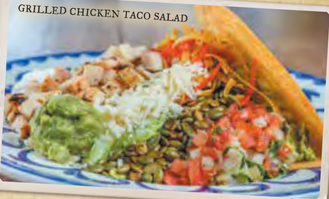
GRILLED CHICKEN TACO SALAD

Homemade tostada taco shell filled with romaine lettuce, refried beans, pico de gallo, cotija and jack cheese. Topped with grilled chicken, roasted pepitas, sour cream, guacamole and your choice of dressing. 15.00