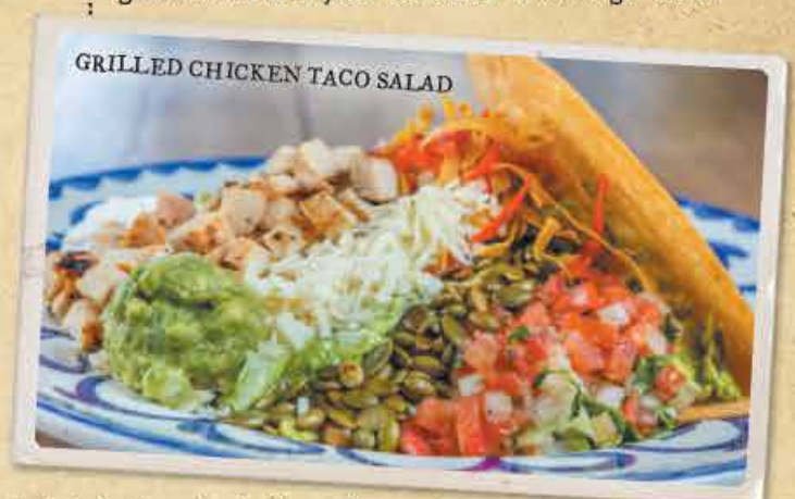
GRILLED CHICKEN TACO SALAD

Homemade tostada taco shell filled with romaine lettuce, refried beans, pico de gallo, cotija and jack cheese. Topped with grilled chicken, roasted pepitas, sour cream, guacamole and your choice of dressing. 15.00