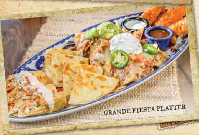
GRANDE FIESTA PLATTER

Chicken on a mound of warm chips, melted cheese, refried beans and guajillo chile sauce topped with fresh jalapeños, tomatoes, green onions and guacamole. 12.00 Steak* add 2.00