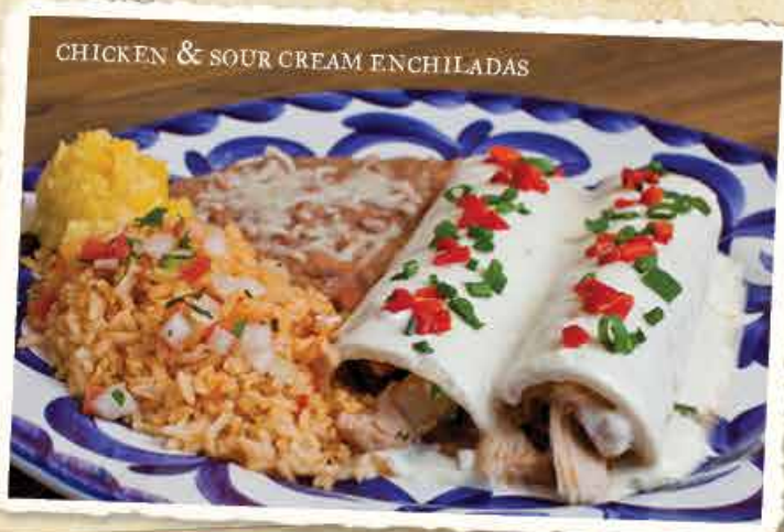
CHICKEN & SOUR CREAM ENCHILADAS