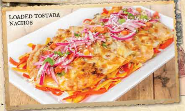
LOADED TOSTADA NACHOS