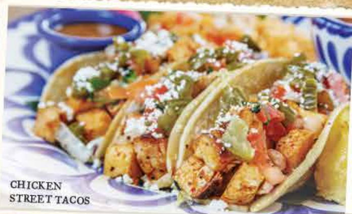
CHICKEN STREET TACOS