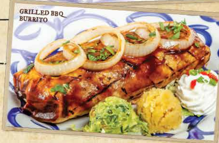
GRILLED BBQ BURRITO