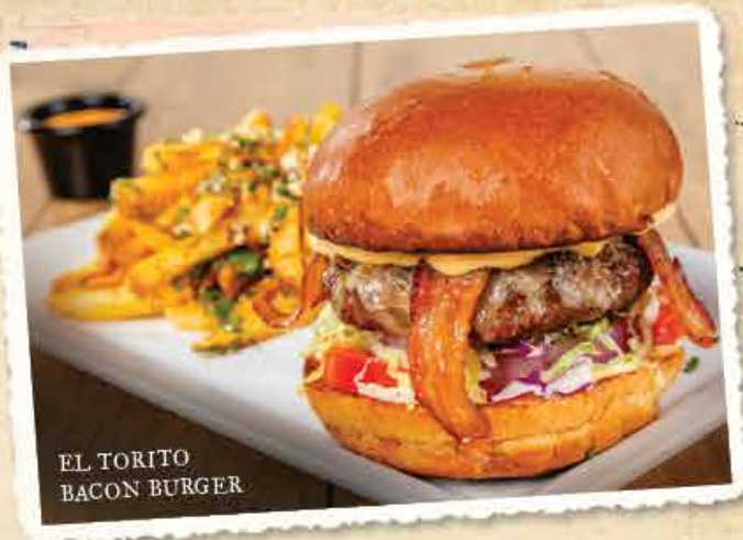
EL TORITO BACON BURGER

Our house-made tortilla soup served with our signature Mexican caesar salad. 8.50