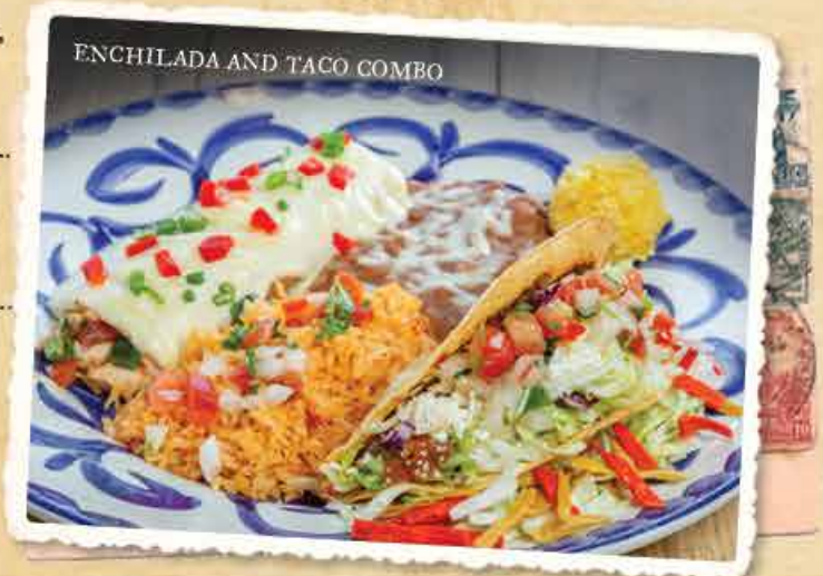
ENCHILADA AND TACO COMBO

This traditional dish mixes chicken, cheese, red and green bell peppers, onions and tomato-jalapeño sauce on a bed of rice. Topped with sour cream and served with choice of tortillas. 16.00