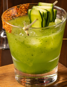
JALAPEÑO CUCUMBER MARGARITA