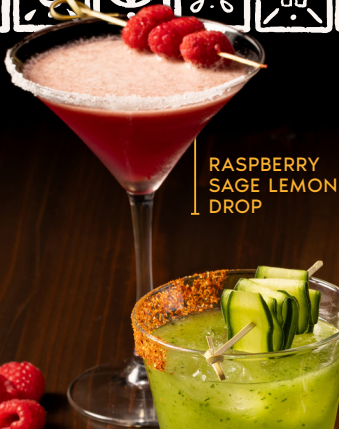
RASPBERRY SAGE LEMON DROP